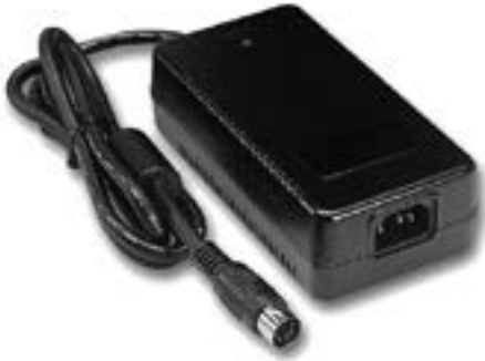
5.75" x 3" x 1.7"